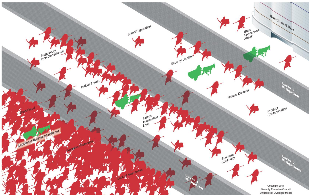
Figure 1: Each layer of security stops a large percentage of threats (or attackers). However, because businesses inevitably choose to accept some risk, residual risk will always exist.

Corporate security enables businesses to do their business. It responds to changes in the company’s willingness to take risks, informs executives of the potential impact of risks, and ensures that higher-risk activities can be taken with as much security as possible by incorporating multiple layers of protection.